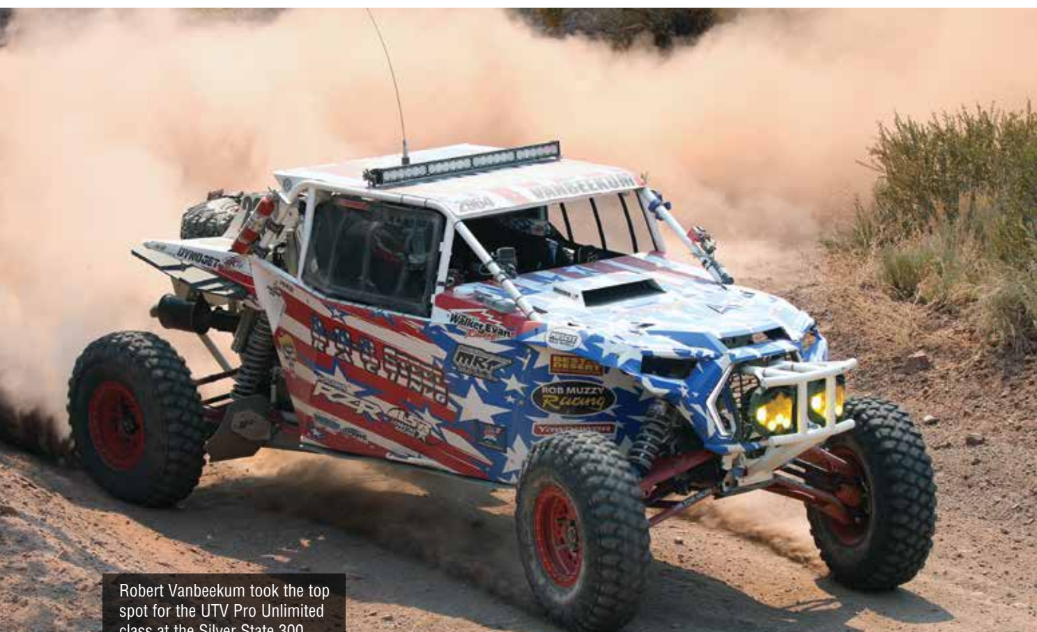
Robert Vanbeekum took the top spot for the UTV Pro Unlimited class at the Silver State 300.