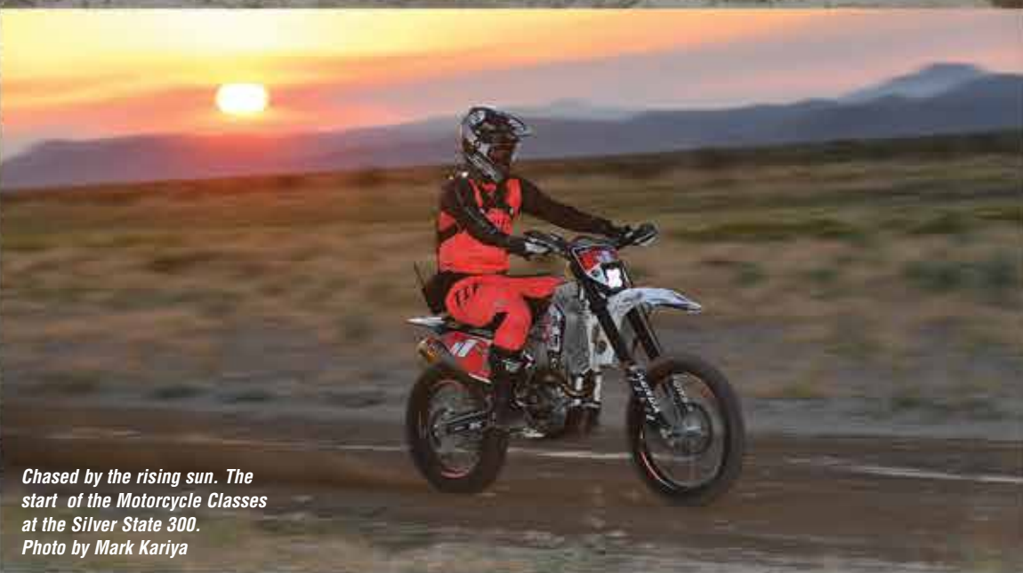
Chased by the rising sun. The start of the Motorcycle Classes at the Silver State 300.