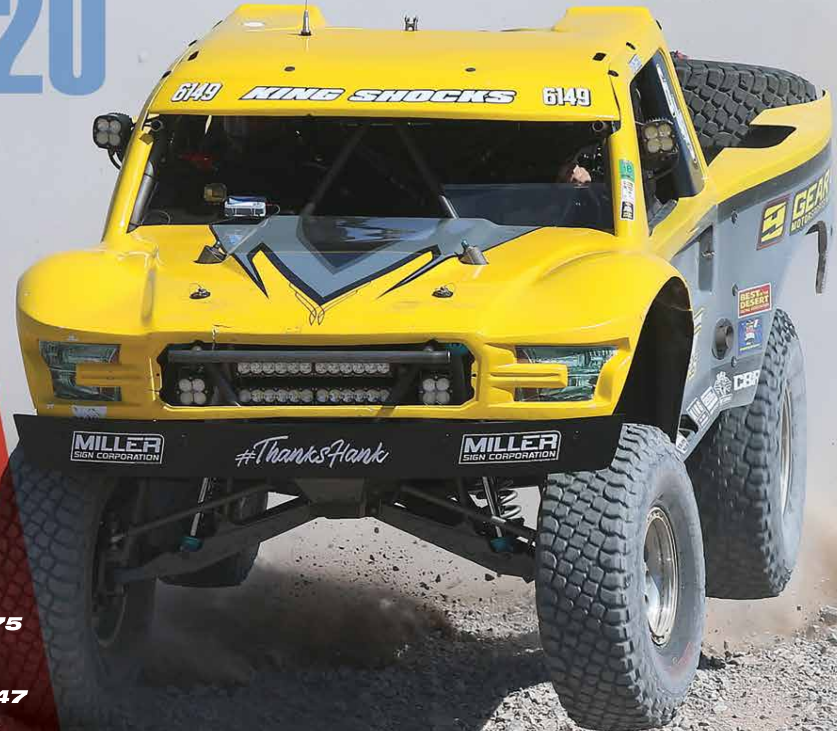
Background photo of Ray Griffith at Silver State 300 Time Trials