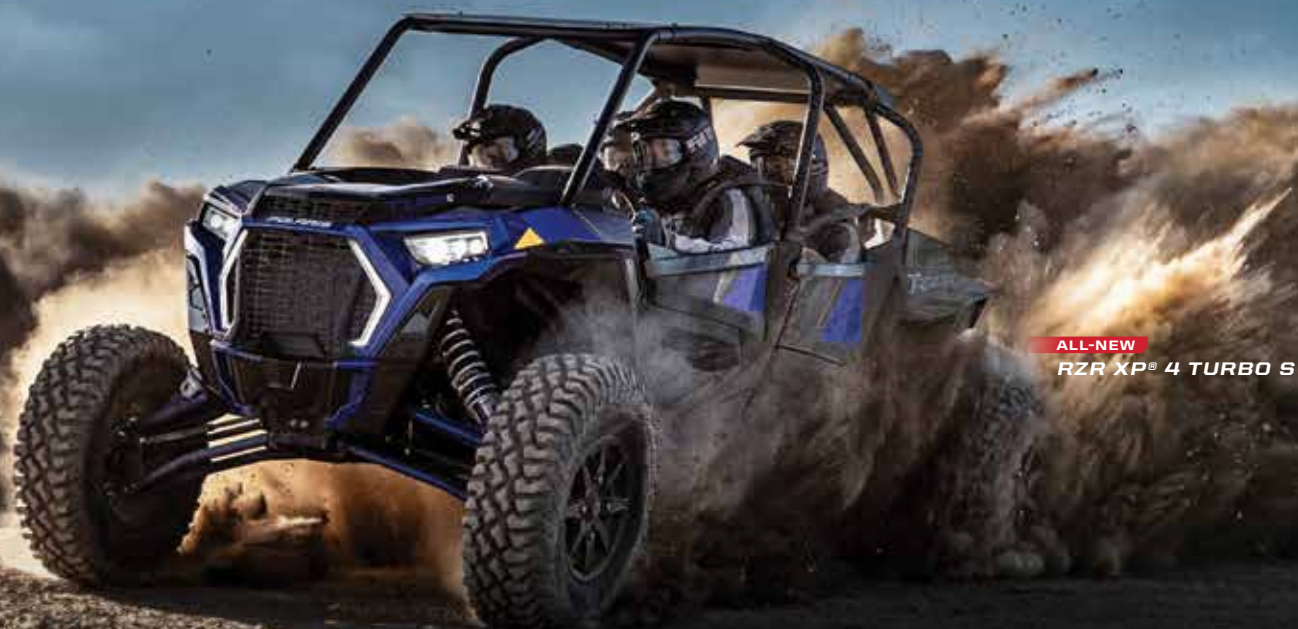
ALL-NEW RZR XP® 4 TURBO S

Unrelenting performance without boundaries, Polaris® RZR® stands alone. Our passion for the off-road is only surpassed by our pursuit for the ultimate riding experience. RZR® is a driving force, always on the throttle, and recognized as the world's undisputed leader for extreme-terrain performance and off-road adrenaline. See your local dealer or visit RZR.POLARIS.COM for more information.