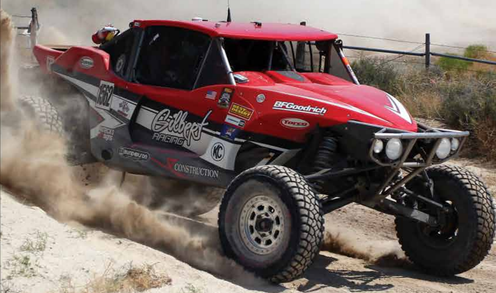
Ladd Gilbert debuted a new Class 1500 car at the Silver State 300 and captured a 3rd place podium finish for the class.