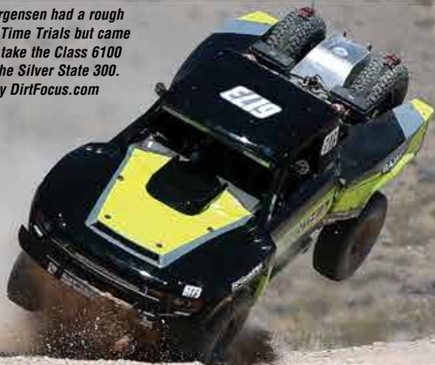
Kyle Jergensen had a rough time at Time Trials but came back to take the Class 6100 win at the Silver State 300.

We're grateful to have some of the best motorsports photographers around providing photos for use in our event programs. Thanks to those who captured the action and scenery from the 2020 Silver State 300 for us.