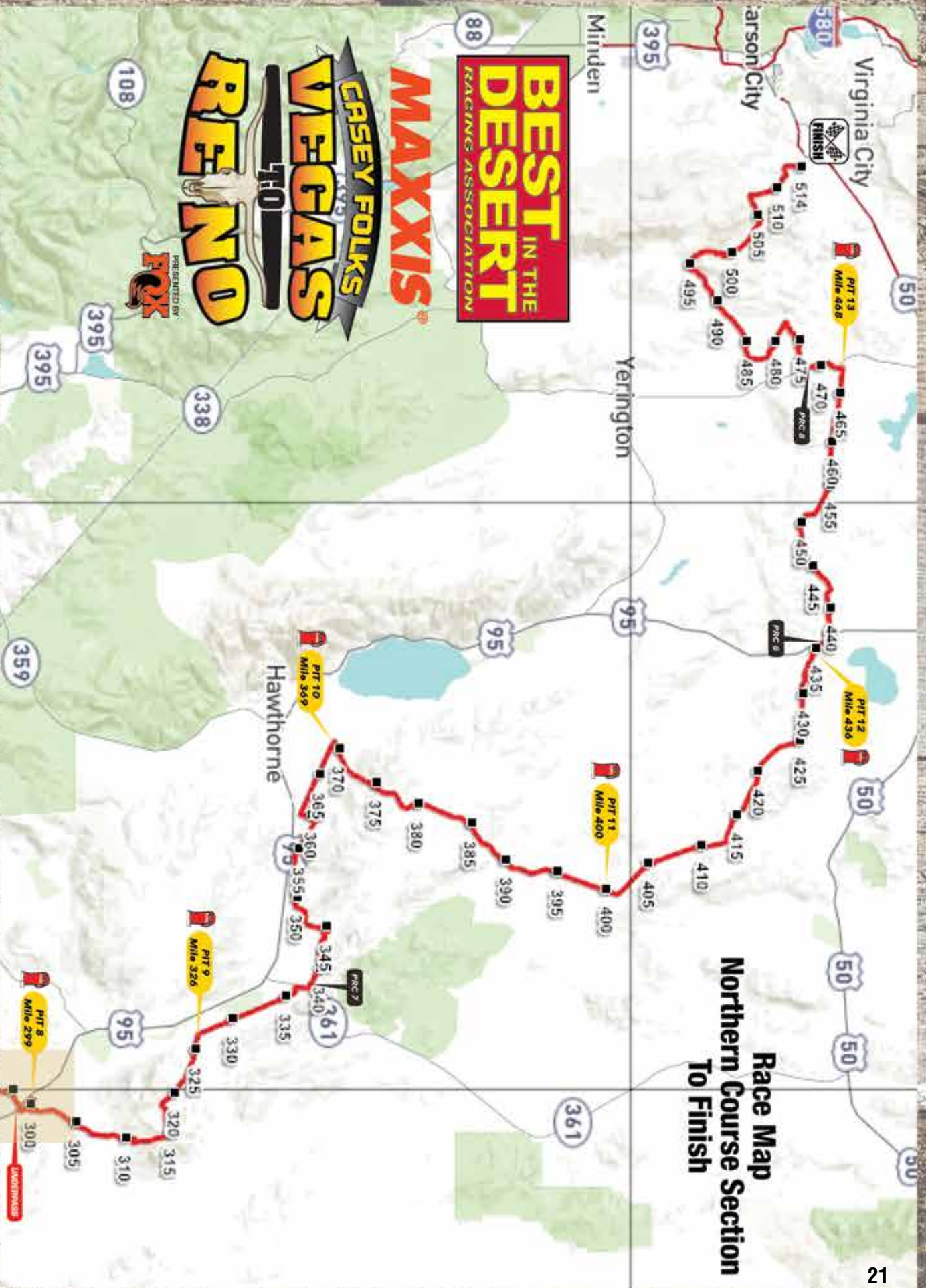
Race Map Northern Course Section To Finish