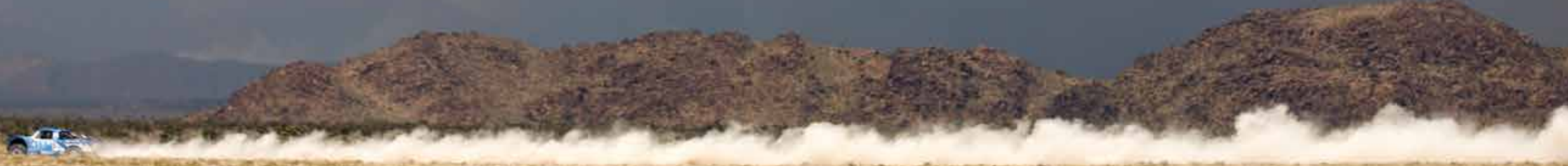
Jason Voss started the Silver State 300 with a massive wild fire storm erupting in the background.