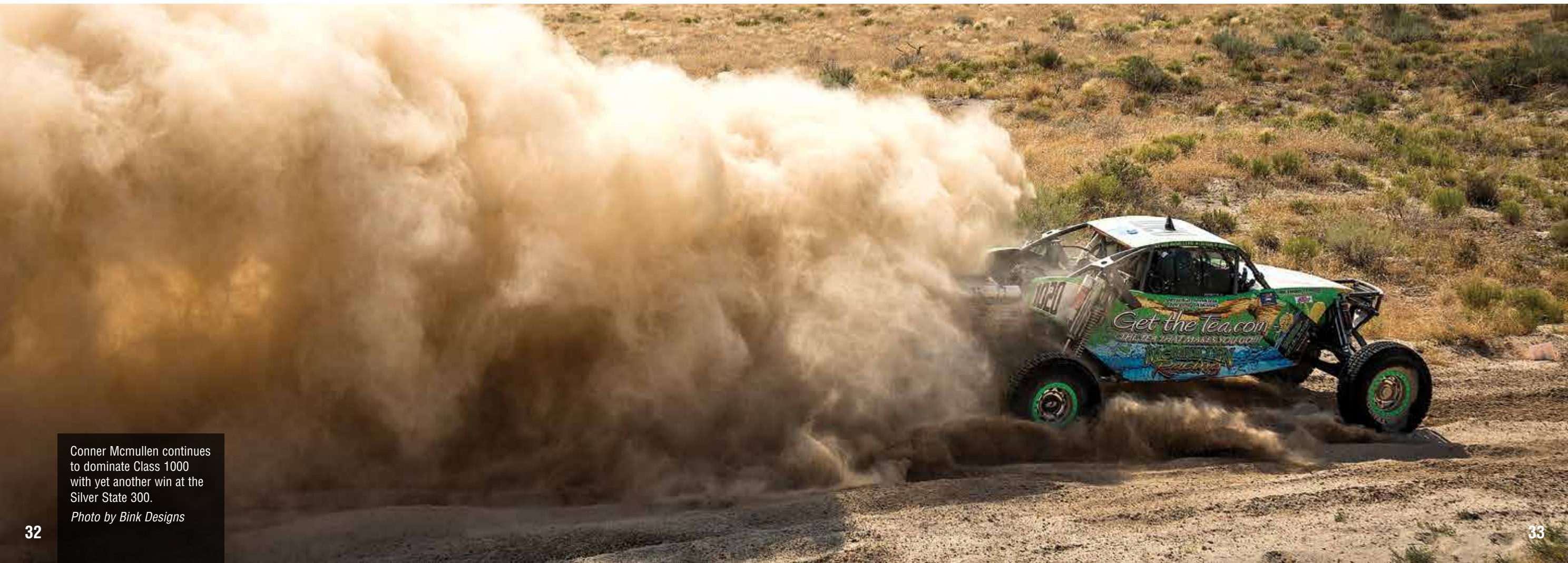
Conner McMullen continues to dominate Class 1000 with yet another win at the Silver State 300.